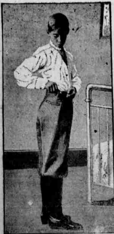
WIDOW JONES ADJUSTABLE KNEE PANT PAT. JAN. 13, 1903

The trousers of Widow Jones knee suits, (costing $5.00 or more) are made with the patent adjuster, used exclusively by Widow Jones. Suspenders are unnecessary. They have the fashionable "peg top" effect, allowing perfect freedom of motion. They are lined throughout. They have taped and serged seams. They wear longest.