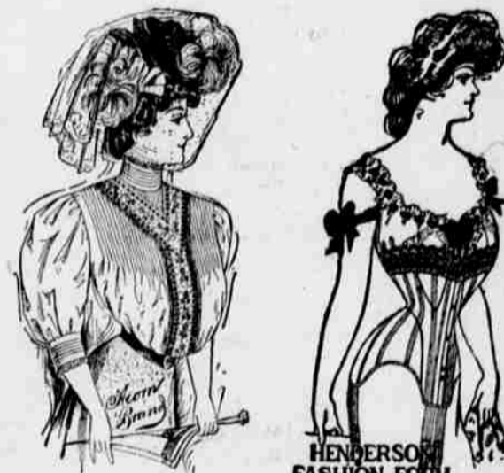
HENDERSON FASHION FORM CORSETS

We have 6 Ladies' Suits left, your choice for $6.98. The skirts alone are worth more than we ask for entire suit.