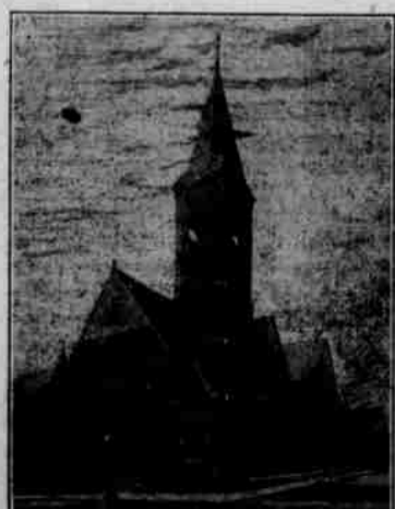
First M. E. Church at DuBois.

Veribest Rubber —AND— Cilmax Asphalt "THE ROOFINGS THAT NEVER LEAK." Need no paint. Samples, prices, etc., on request. McHenry-Millhouse Bldg. Co. South Bend, Ind. FOR SALE BY Reynoldsville Hardware Co. REYNOLDSVILLE, PA.