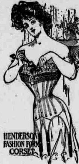
HENDERSON FASHION FORM CORSET

The inside modeling of "Fellowcraft" shoes is such that narrow-toed styles fit with the same comfort as the broader ones. Your wise young men will enjoy the snappy individual style of the shoe. All leathers. Price $3.50.