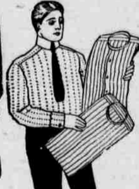
Men's and Boys' Christmas Shirts

Four-in-hands, puffs, ascots, string ties, shield bows and neck in all the latest imported silks. All the newest shades and combinations of colors. All widths in four-in-hands. Small string ties for the boys. 25c, 50c, $1.00.