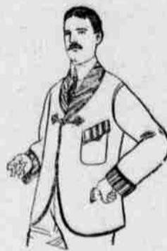
Men's Smoking Jackets and Bath Robes.

FOR MEN AND BOYS, WITH MERIT WHICH WILL BE APPRECIATED BY MANY A FATHER, SON, HUSBAND AND BROTHER ON CHRISTMAS MORNING.