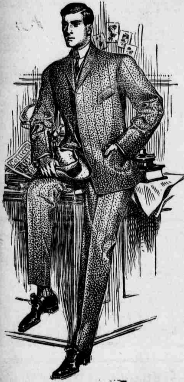
MEN'S AND BOYS' CLOTHING FOR CHRISTMAS.

Men's and Boys' Overcoats and Raincoats here in all the late styles and colors. $10.00, $12.00, $15.00, $18.00, $20.00, $25.00. Men's Suits in this season's latest cut in Thibets, serges and worsteds. $5.00, $8.00, $10.00, $12.00, $15.00, $18.00, $20.00. Boys' Overcoats and Raincoats, all the late fall styles and colors $1.75, $2.00, $3.00, $4.00, $5.00, $6.00, $7.00, $8.00, $9.00.