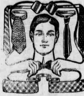
Men's and Boys' Christmas Neckwear

Here in all the late fall colors, as browns and two-faced plaids, of greens and reccedias. $3.50, 4.50, 5.00, 6.00, $7.50.