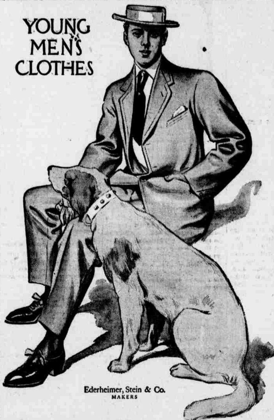
Ederheimer, Stein & Co. MAKERS