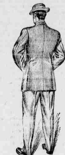
Clever Clothes Steafel, Strauss & Conner

Fancy mufflers 50c to $1.00 Fancy Neckwear 25c to 50c Gloves 25c to 50c Leather Gloves 50c Shirts 20c Suspenders 15c to 25c Handkerchiefs 5c to 50c Slippers 35c to 50c Watch fobs 50c to $1.24 Caps 25c to 50c Suit cases $1.00 to 12.00 Sweaters 50c to $1.50 Over coats $3.00 to 10.00 Suits $2.00 to 6.00 Cuff Buttons 25c to $1.00 Money purses 25c to 50c Trunks $2.50 to 10.00