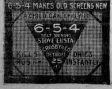
If your dealer hasn't | Blog-Stoke Co. has