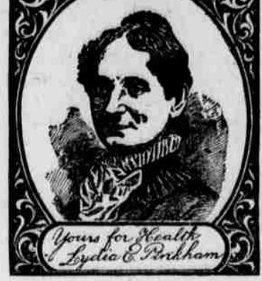
Yours for Health Lydia E. Pinkham

This remarkable woman, whose maiden name was Estes, was born in Lynn, Mass., February 9th, 1819, coming from a good old Quaker family. For some years she taught school, and became known as a woman of an alert