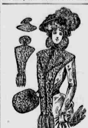
COLLABETTE AND MUPP.

sort are demanded by fashion and muffs are apt to be a requisite of comfort as well as of style. These excellent models are cut in the latest style, and are well adapted to the remodeling of last season's furs, and to making from Persian lamb cloth and seal plush. As shown the material