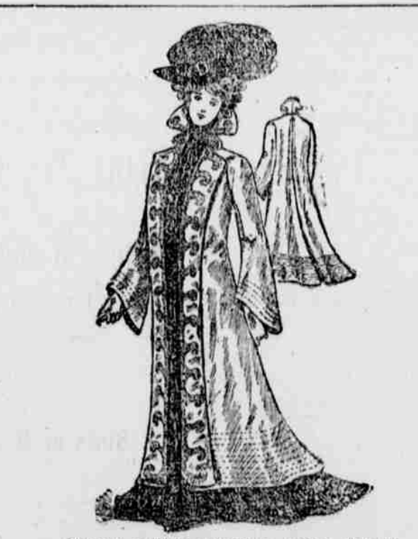
SMART, YET PRACTICAL LONG CLOAK.

The divided skirt is full, gathered at the waist and again below the