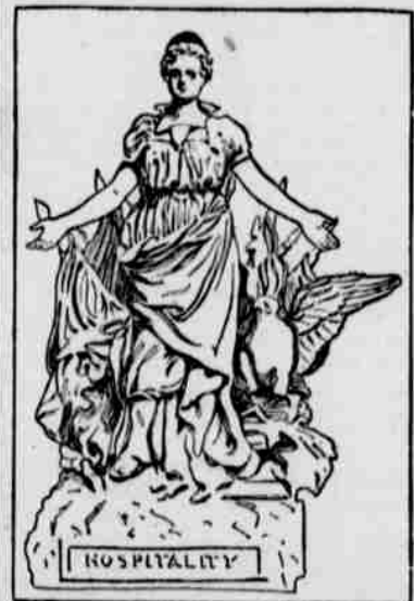
FIGURE OF HOSPITALITY FOR TRIUMPHAL BRIDGE

Another band engaged is the Ithaca Band of Ithaca, N. Y., which is backed