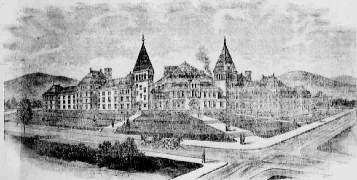
CENTRAL STATE NORMAL SCHOOL, LOCK HAVEN, PA.

To be given by THE STAR, Reynoldsville, Pa.