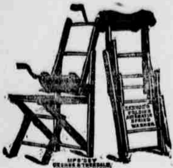
The Automatic Washer.

The Wood Folding Automatic Spring Washer has been before the public since November 9, 1886, during which time it has been successfully and rapidly introduced into thousands of houses in the states of Iowa, Missouri, Illinois, Indiana, Ohio, Tennessee, Arkansas, Texas, California, Oregon, Washington, Nevada, South Dakota and many other places by enterprising men who have engaged in the sale in these different localities. The trade is becoming thoroughly established. It is displacing the Chinamen in the Golden State.