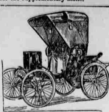
'TOURING CART' FOR THE TRANSCON-TINENTAL TOUR.

and back of it another case of handsomely polished wood, which is used for the supplementary mails.