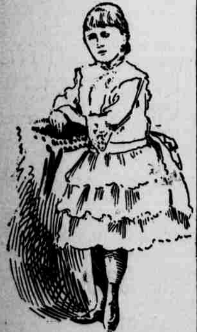
AS A CHILD, 1884.

pretty young woman, with a well developed, supple figure. She is essentially womanly and gentle in manner and looks.