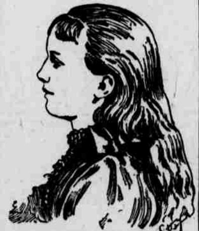
THE LITTLE QUEEN AT THIRTEEN, 1893.

Queen Wilhelmina has been trained to possess all the qualities of a typical Dutch housewife. As a little girl she had a little house of her own, where she did all the housework herself. Her portrait in the national costume of a Dutch housewife, with a linen coiff over her head, is one of the most pleasing presentments we have of her.