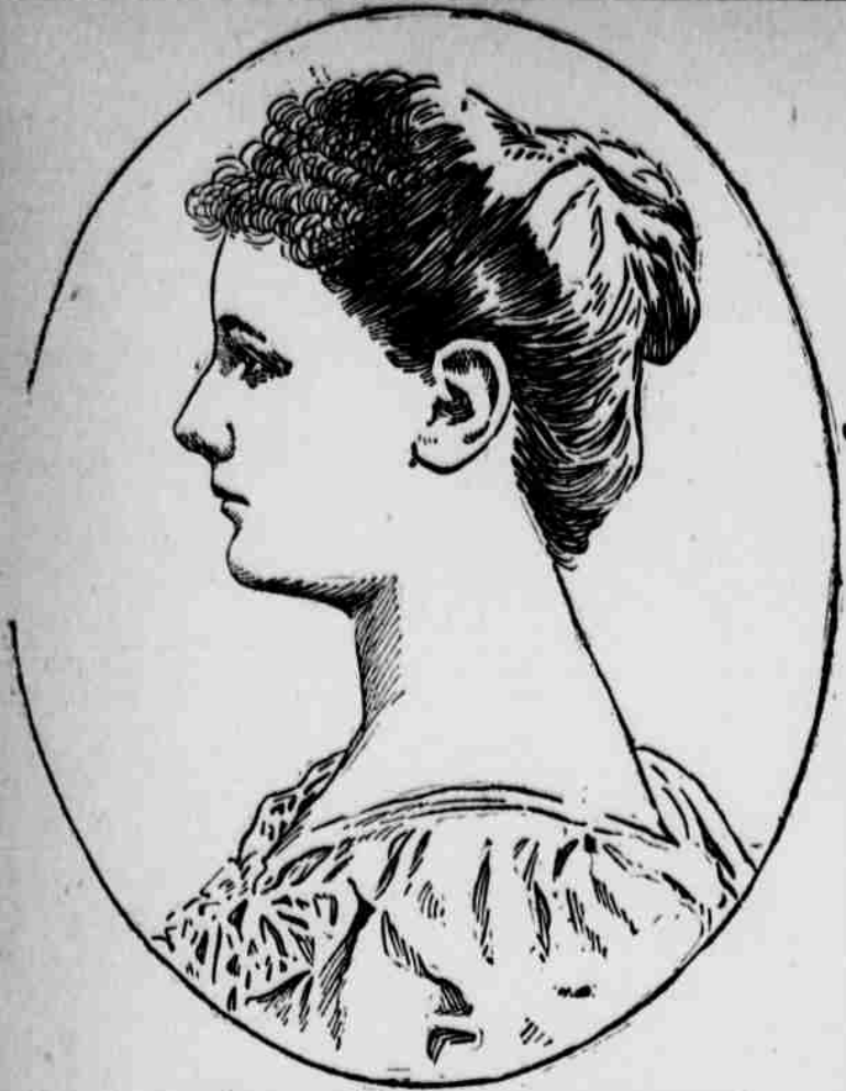
LATEST PORTRAIT OF QUEEN WILHELMINA OF HOLLAND.