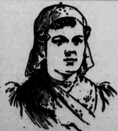
QUEEN WILHELMINA IN A DUTCH-NATIONAL COSTUME, 1894.

following morning trumpeters will arouse the citizens from sleep with sacred music from the steeples of the various churches. Then will come, at