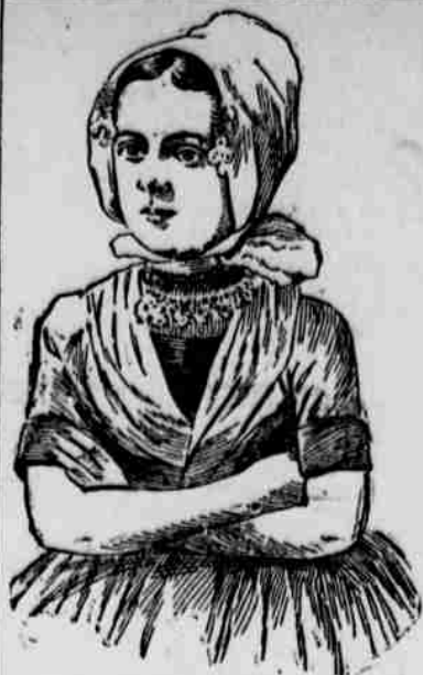
THE PICTURE THAT IS MOST POPULAR—WILHELMINA DRESSED FOR A DUTCH KERMESS.

name of Wilhelmina Helens Pauline Maria. It is doubtful whether the loyal Netherlanders would to-day ex-