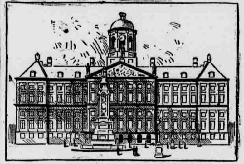
WILHELMINA'S PALACE AT AMSTERDAM.

A home-made filter for purifying drinking water for domestic uses is described by the New York Herald as consisting simply of an ordinary de-