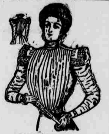
LADIES' FULL WAIST.

A black tulle frock which differs from other black tulle frocks is spangled with jet and silver from the bottom of the skirt to the curve of the hips, leaving a free space of about a quarter of a yard from the waist downward. The bodice is made of gauged tulle, transparent upon the arms and upper portion of the chest and back, and forms a sort of cuirass to the waist of heavy steel and jet embroidery. No color is