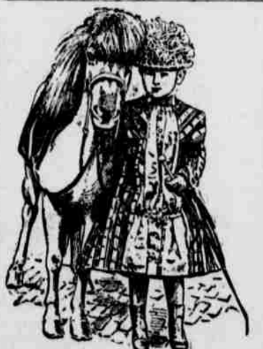
WILHELMINA AND HER FIRST SHETLAND PONY.

young Queen and her mother to all the details of a democratic festival conducted mainly for the entertainment of the masses. The Queen, when she enters Amsterdam in triumph, will drive through the poorer section of the city as well as through the finest residential quarter, and every day for a fortnight she will be in plain sight of the people both there and at the Hague. There will be a series of popular fetes, with few