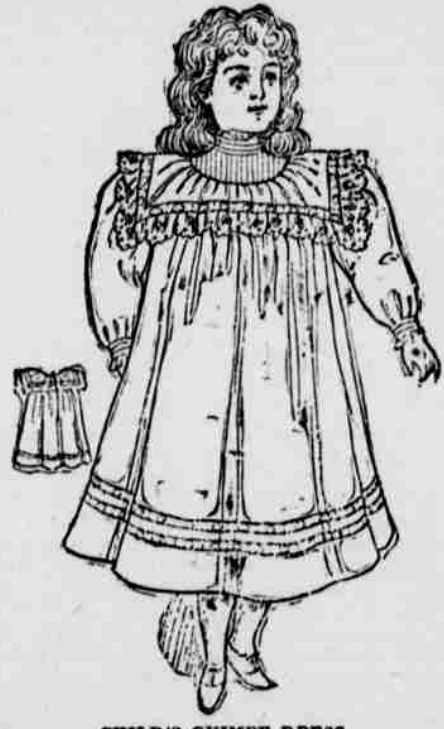
CHILD'S GÜMPRE DRESS.

The wrinkled sleeve adjusted over two-seamed linings (which may be omitted at will) and the gathered epaulettes are a stylish feature of this pretty waist. The mode is especially adapted to thin silks of India and Japanese weave, mousseline de soie, liberty silk and grenadine, while silk, embroidered chiffon, passementerie, gauze, net and ribbon ruching and