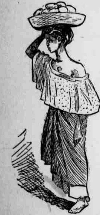
A LADRONE BELLE.

The Spaniards have controlled the islands without interference or serious trouble from the natives. There is a small garrison at Agaña, the capital, where the Governor-General has resided. Many natives of the Carolines have been imported into the Ladrone Islands and the races are interestingly mixed. The blending of the tall, copper-colored, curly-haired, long-bearded and mustached Carolinians with the Phillipian-looking Ladrone, with their dark Malay skin,