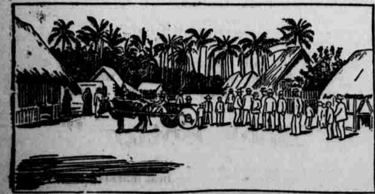
THE BUSINESS SECTION OF AGAÑA, PRINCIPAL TOWN OF THE LADRONES.

So little has been done to civilize the people that they live in about the same primitive fashion as characterized them when Europeans first visited them.