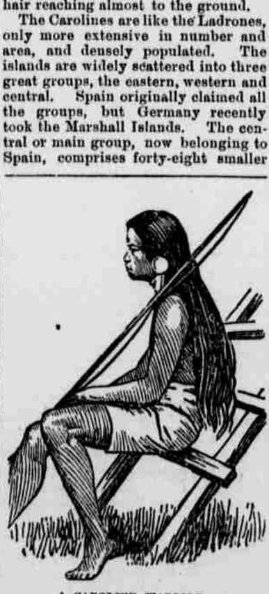
A CAROLINE WARRIOR.