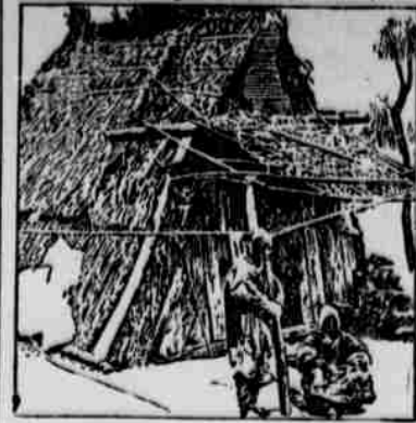
NATIVES AND HUT IN THE LADRONES.

Customs, superstitions, dress, religion, etc., prove that the people of the Ladrone have a common origin with the other races of Polynesia, but they have lived so long by themselves that they have a distinct language. Some writers have argued that the race is of American origin, while