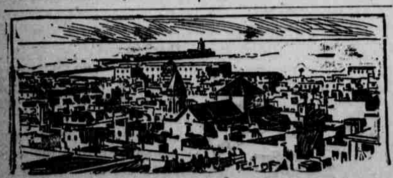
CADIZ AND ITS HARBOR—THE MOLE AND LIGHTHOUSE IN THE DISTANCE.

Thunder and Lightning. It is said that lightning may be recognized at a distance of two hundred miles when the clouds among which it plays are at a high altitude, but that thunder can seldom be heard at a greater distance than ten miles. The sound of thunder is also subject to refraction by layers of different density in the atmosphere, as well as to the effects of "sound shadows," produced by hills and other interposed objects. These are among the reasons for the existence of the so-called "sheet," or "summer," lightning, which seems to be unattended by thunder.—Youth's Companion.