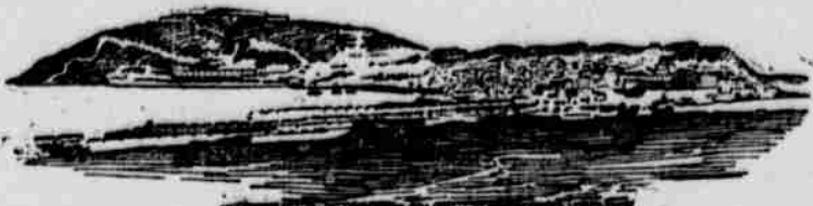
ISLAND OF CEUTA, SPAIN'S PENAL SETTLEMENT.

The old city, as distinguished from the modern additions growing out of the industrial developments of the place, has played an important part in the history of the world since the days when it was raised by Augustus to the rank of a Roman colony. But the Catalonians, or Catalans, whose capital