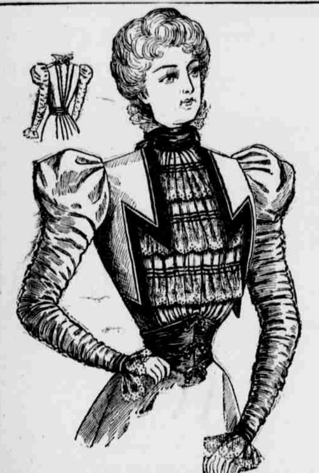
LADIES' BOLERO WAIST. are covered with pocket laps. The sleeves are two-seamed and follow the

As to furs, sealskin, astrakhan, Arctic fox, Persian lamb, sable and ermine, are shown by the big furriers. Chinchilla is much more costly than it has been for seventeen years, and chinchilla of fine quality is very hard to get. The Arctic fox in blue gray is