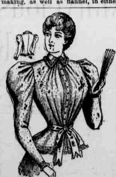
A DRESSING SACQUE OF SPOTTED DIMITY.

Cashmere, challies and all woolen textures are appropriate for making, as well as flannel, in either