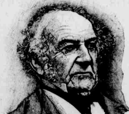
as contributed an important article for the next lume of The Companion, to be published in the New Year's Number.

They Used to Say "Woman's Work is Never Done."