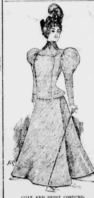
COAT AND SKIRT COSTUME.

When the collarette was removed and the jacket unfastened a tight-fitting vest was exposed. The material used for the vest was quite in keeping with the smartness of the gown. It was tan vesting spotted with tiny red dots and buttoned directly down the front.