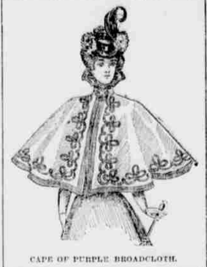
CAPE OF PURPLE BROADCLOTH.

To such a woman the finishing touches of her costume are all-important, and at no time have the fashions admitted of so much individuality in this respect as at present. Collars are nowadays a study in themselves, and even tailor-made gowns are worn with