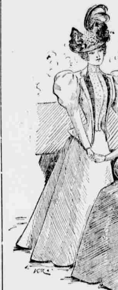
TAILOR-MADE GOWN SEEN AT THE SOROSIS MEETING.

One well-known club woman who is invariably well-gowned wore a severely plain frock made of cinnamon brown broad-cloth. The jaunty jacket was buttoned quite close and over it was worn a short catterette, fashioned of senskin and finished with a Russian sable collar and a cascade of sable tails down each side of the front.