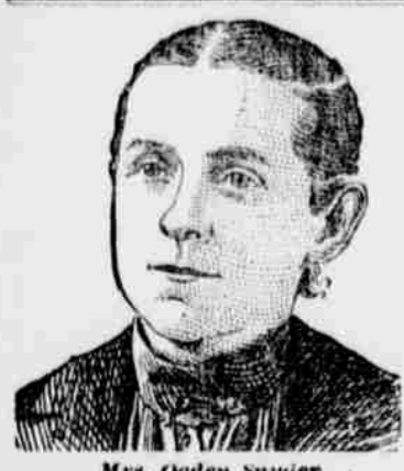
Albany, N. Y.

Chanliness, exercise and diet are the cards and virtues of good health. Take care of the first to and if you have what and have to eat you beed never be II. It is chanced that Garbell Ten a simple near remedly, overcomes the results of wrong living.