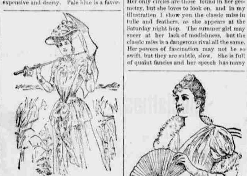
ite color, with very short basques, and