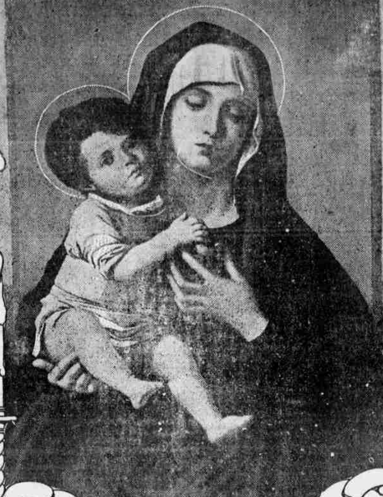
MADONNA GIOVANNI BELLINI