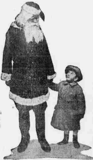
TAKING SANTA TO KINDERGARTEN.

"I sat up all night holding that kid's hand. I had a man in attendance, who