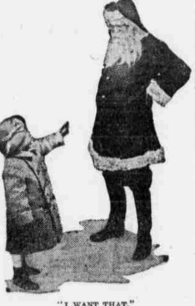
"I WANT THAT."

"'I can't see that I have any advantage over the giraffe,' I said.