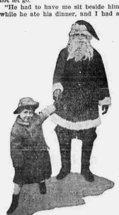
"HE TOWED ME THROUGH THE AISLE."

big, fat butler shoving my chair around for me and waiting on me. I got some birds and one thing and another under my pillow and my furs, but I was aw-