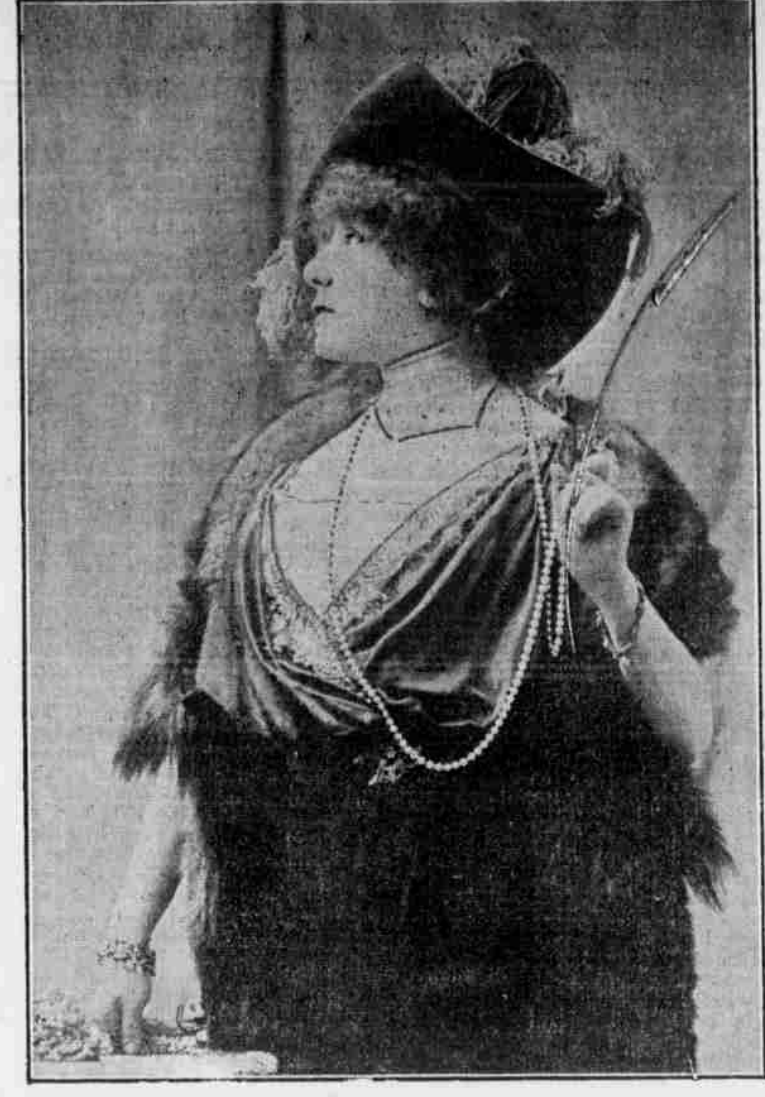
COMING AT LYRIC-SARAH BERNHART IN MOTION PICTURES