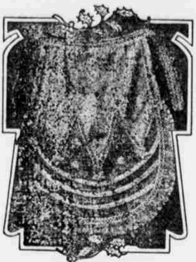
CHAFING DISH APRON.

Fine lawn was the material used in this case. It was cut in a single piece with the three points below, a handsome beading being run around the out-