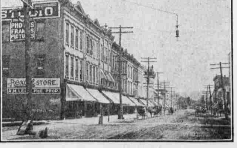
A BUSINESS BLOCK; MAIN STREET LOOKING SOUTH.