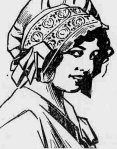
CAP FOR THE CONVALESCENT.

Here is a Cute Cap for the Convalescent Friend