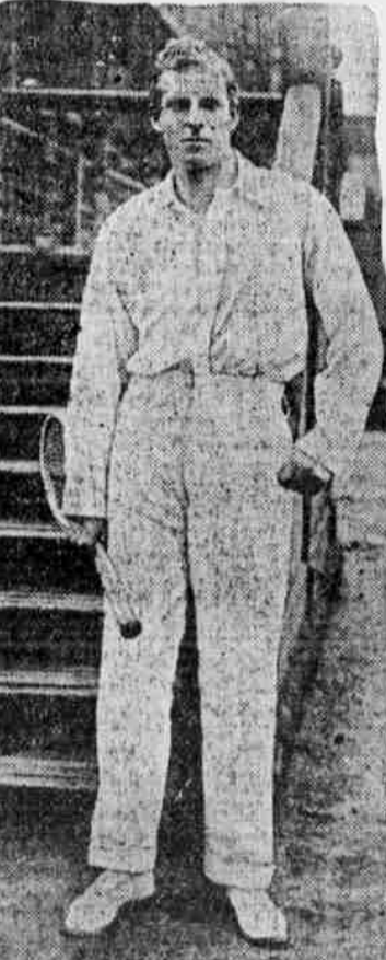
A. F. WILDING, AUSTRALIA'S CRACK TENNIS PLAYER.

A. F. Wilding, who was a member of the Australasian defending team two years ago and who last July retained the British tennis championship title by defeating H. Roper Barrett at Wimbledon, announced recently that