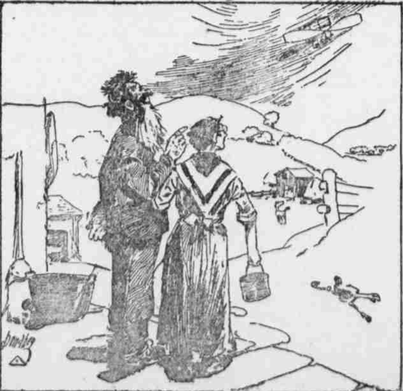
-Donahey in Cleveland Plain Dealer.