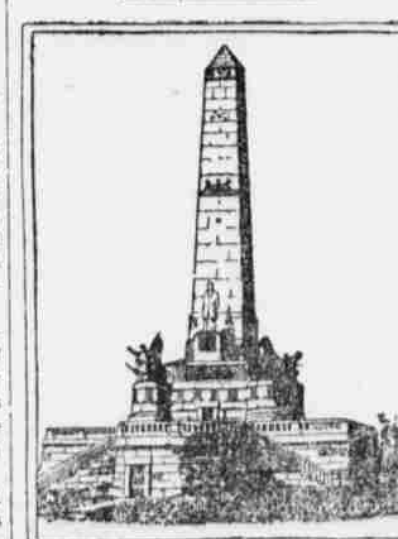
The New Lincoln Monument at Springfield, Ill.