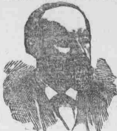
THE LATE RICHARD P. BLAND.

Richard Parks Bland was a consistent leader of the Democracy, the "Father of the House," and one of the