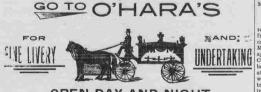
OPEN DAY AND NIGHT.