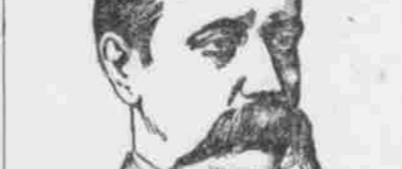
MAJOR GENERAL LUDLOW.

"The Spaniards have left Havana with scarcely an attribute of modern civilization, and practically in the san-