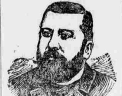
M. CHARLES DUPUY.

It is no longer a secret that the quality of Battle Ax PLUG is different from that of any other chewing tobacco ever made. It stands to reason that it is better than any other chewing tobacco; or why does it sell five times more than any other brand? You can fool the eye—with color. You cannot fool the mouth with taste. Battle Ax tastes right—chews right—costs right and is "right." Remember the name when you buy again.