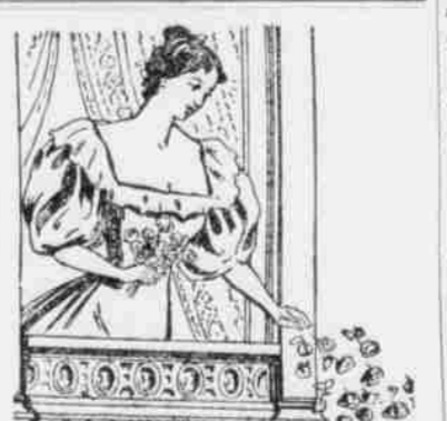
Many a woman throws away the flower of her youth—her beauty, her amiability and her capacity for usefulness and motherhood—without realizing it. There is no sadder sight than that of a young woman who has for years been bearing up bravely and stoutly under physical tortures that would drive a man to the mad-house.

London, Oct. 28.—The Madrid correspondent of The Standard says: "The government has good reason to believe that the United States intend to retain the Philippines on the ground that President McKinley must satisfy public opinion. Spain, however, cannot yet believe she will be deprived of the Philippines without some pecuniary compensation. In addition to a recognition of the Philippine loan of 1898."