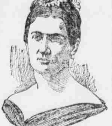
THE LATE MME. CARNOT.

Madame Carnot was clever and popular. She did much to make republicanism fashionable in France. When her husband was elected president they lived in apartments which they rented for only $2,000 a year, and they left that home with reluctance. Yve Madame Carnot was more than equal to her position when she became the first lady of the republic. She was deaf, but she showed the greatest tact and cleverness in hiding this defect. She was an admirable linguist and a good housewife. She was a grandmother, yet she wonderfully preserved her youthful appearance.