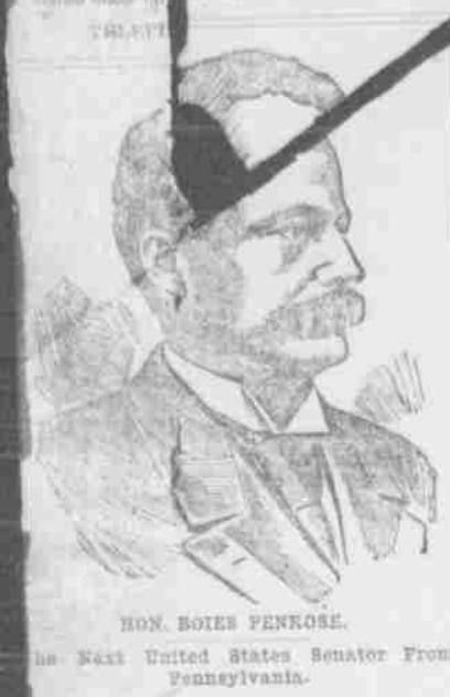
HON. BOIES PENROSE.

Published every evening, except Sunday, at 100 N. Second Street, Philadelphia, Pa.