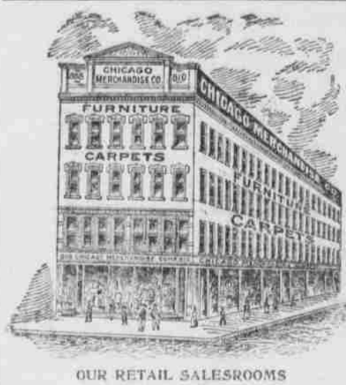
OUR RETAIL SALESROOMS

Satisfaction Guaranteed or Money Refunded to any Dissatisfied Patron