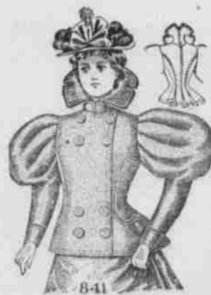
SILKS AND DRESS GOODS.

Fashion's favorite fabrics at popular prices of strictly reliable goods in blouses and coverts. All the newest styles which Dame Fashion has declared to be popular can be found here. All the correct weaves and up to date shades for the fall and winter of 1891 are shown in profusion.