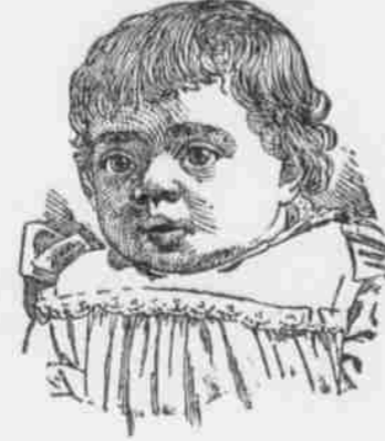
ONE OF THE BRIGHT TRIPLETS.