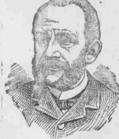
THE LATE M. DE GIERS.

The Eminent Statesman Who For Years Controlled Russia's Foreign Affairs. ST. PETERSBURG, Jan. 28.—M. De Giers, minister of foreign affairs, died Saturday night, aged 74.