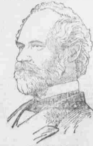
GALUSHA A. GROW.