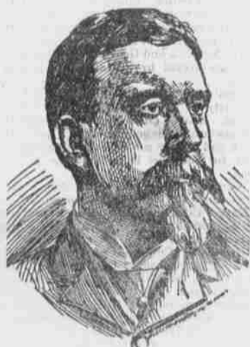
GEN. DANIEL H. HASTINGS.