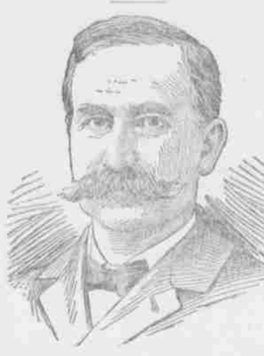
HON. D. NEWLIN FELL. Candidate for Judge of the Supreme Court.