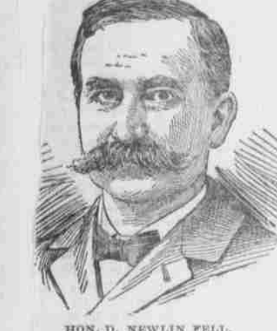
HON. D. NEWLIN FELL, Candidate for Judge of the Supreme Court.