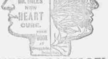
DR. MILES' HEART CURE.

HEART DISEASE! The most common and most dangerous of all diseases. It is a disease of the heart, and it is a disease of the heart. It is a disease of the heart, and it is a disease of the heart. It is a disease of the heart, and it is a disease of the heart.