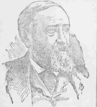
BENJAMIN HARRISON AND HIS ATTITUDE TOWARD THE SOLDIERS.