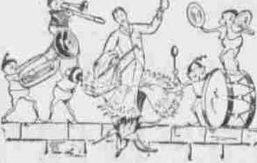
BEST MADE CLOTHING IN PHILADELPHIA

On this youth there are no flies, For we know that when he dies He'll go through the pearly gates, Because he bought that suit at Yates'.