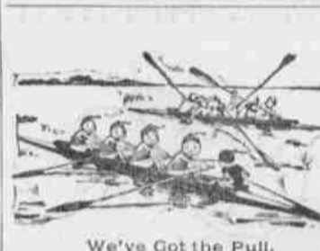
We've Got the Pull.

With a stock of Spring Clothing like ours, and the prices right, the race is easy and all glides smoothly along—no jars, no upsets, no disappointments. This is Boys' Clothing time. Remember that we have the largest and brightest department for Boys' and Children's Goods in the country. All the handsome new things are here of American as well as foreign make.