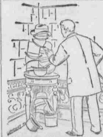
A Corner in Hats.

Some hats are neither worth throwing nor taking out of a corner. A good hat is light, durable, shapely and a pleasure to the wearer; a bad hat isn't worth powder enough to blow it into perdition. Good hats are no more expensive than bad ones, but bad hats are expensive at any price and sensible men couldn't be paid to wear them. Our $2 hat is a perfect gem, and there is no reason to be without one at this low figure. The same is true of our $2 Neckwear and Suspenders. Good shirts from 25c up to $2. All the newest things in gents' underwear, collars and cuffs. Everything at rock bottom price.