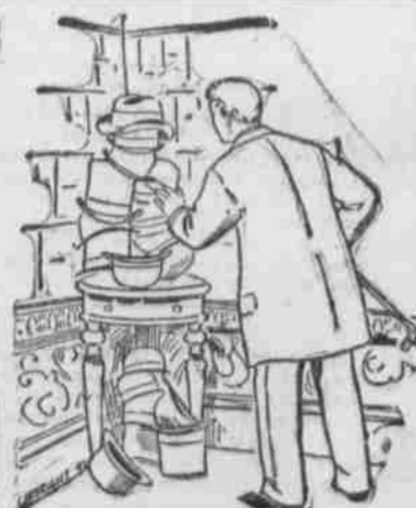
A Corner in Hats.

Some hats are neither worth throwing nor taking out of a corner. A good hat is light, durable, stylish and a pleasure to the wearer; a bad hat isn't worth powder enough to blow it into rebellion. Good hats are no more expensive than bad ones, but bad hats are expensive at any price and sensible men couldn't be paid to wear them. Our $2 hat is a perfect gem, and there is no reason to be without one at this low figure. The same is true of our $2 Neckwear and Suspenders. Good shirts from 25c up to $2. All the newest things in pants, underswear, collars and cuffs. Everything at rock bottom price.