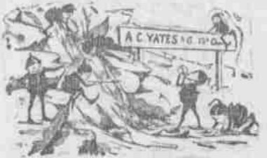
WHAT PHILADELPHIA WANTS.

Like the strong demand for good water in Philadelphia, there is a growing demand for good clothing—strong, reliable, shapely, genteel. None are in a better position than ourselves to furnish such. We have made GOOD Clothing a life study.