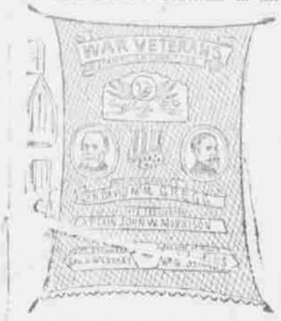
VETERANS' BANNER UNFURLED.