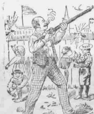
A FULL-GROWN MAN WITH AN ADULT GUN

So thorough is the detestation of Eng-Hish tyranny in New York, that even as early as the afternoon of the third I have seen the police wiping up the side-walks with well-dressed inebriates. In the drug stores boys get their fingers tied up from toy pistol wounds as early